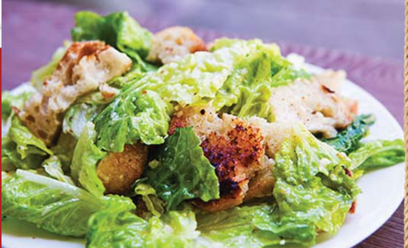
Classic Caesar Salad

Crisp Romaine Lettuce and Baked Parmesan Cheese tossed in our special Caesar Dressing. Add Chicken $1.50 | Popcorn Shrimp $1.95